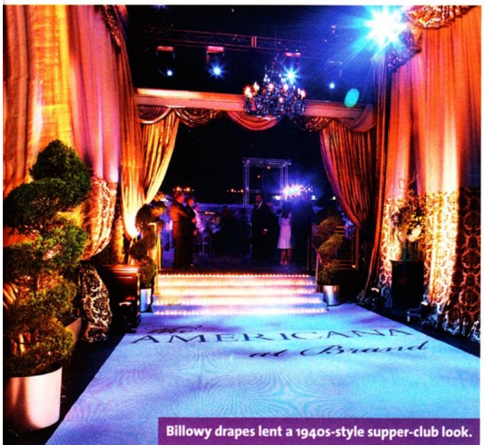
Billowy drapes lent a 1940s-style supper-club look.