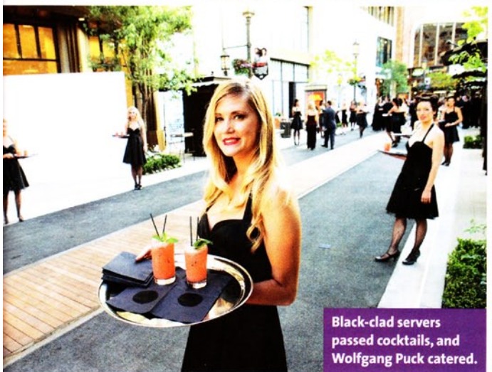
Black-clad servers passed cocktails, and Wolfgang Puck catered.