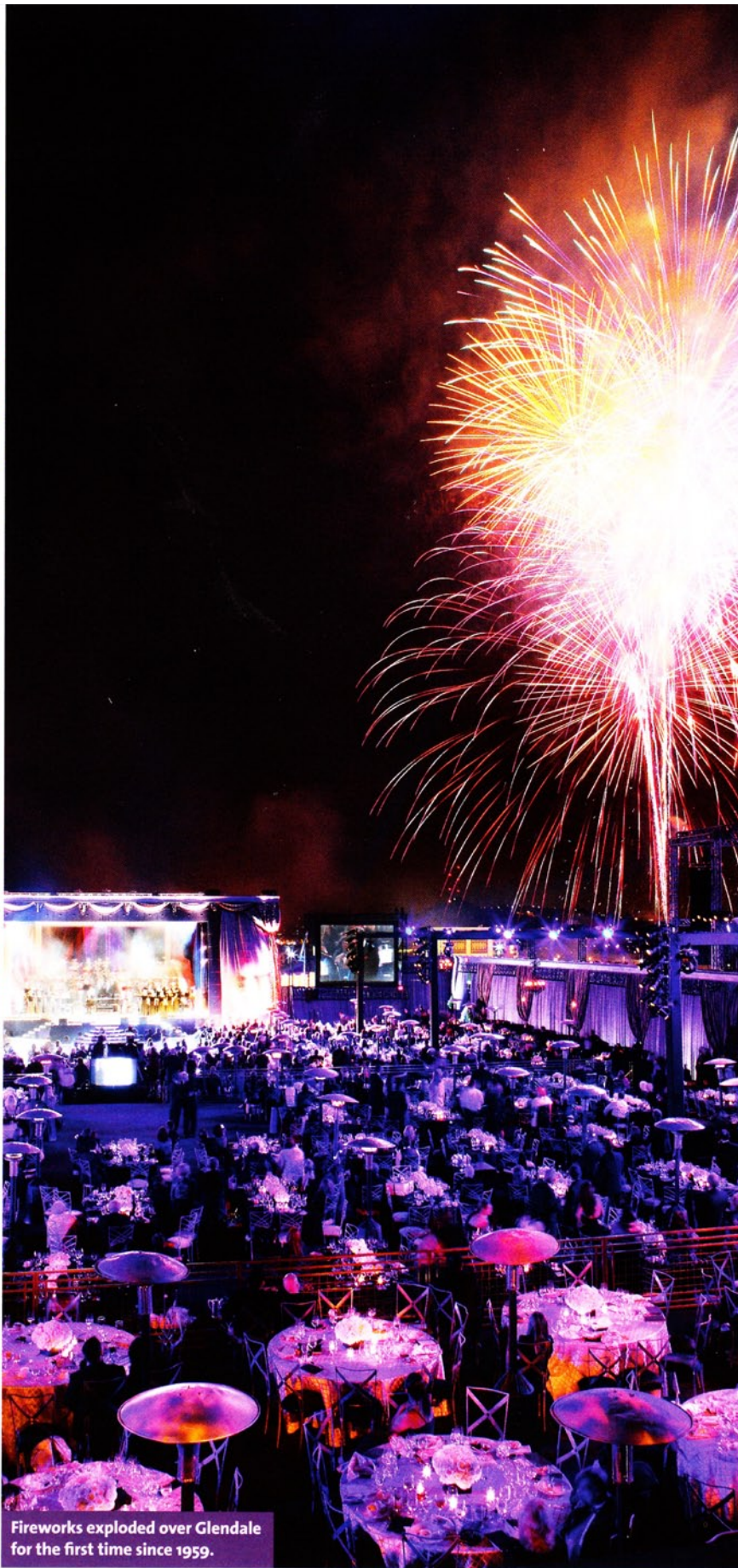
Fireworks exploded over Glendale for the first time since 1959.